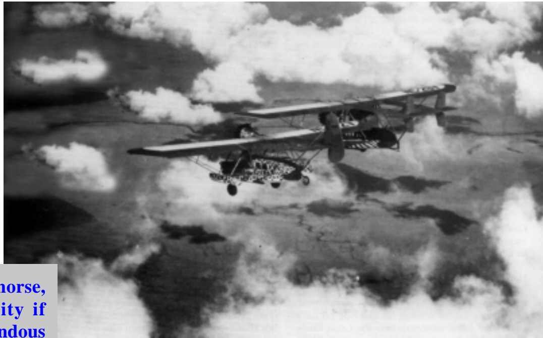
The Johnson Aircraft Formation

"The S-38 was really a workhorse, had seven hours fuel capacity if needed, and could carry tremendous loads at all altitudes."