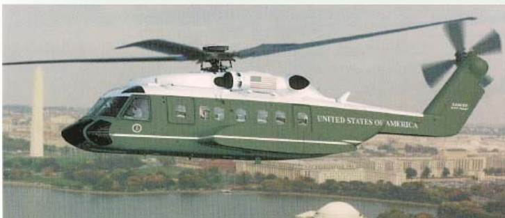
S-92 Presidential Marine One - Candidate for the Future