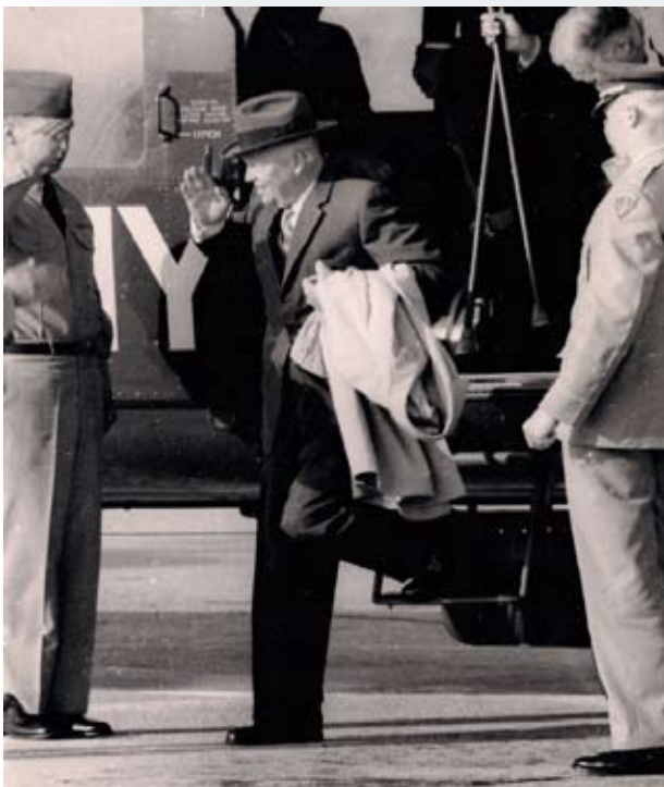
The Army and the Marine Corps shared the presidential helicopter duties from 1958 until 1976. President Eisenhower is exiting the