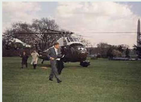
John F. Kennedy