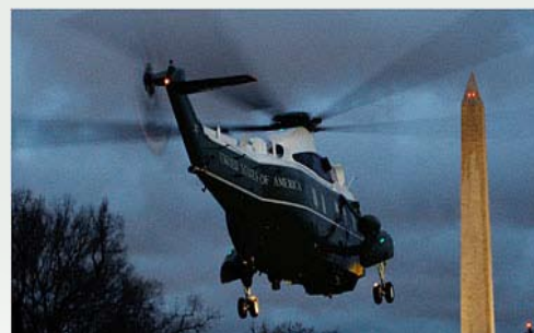
VH-3D Approaching the Washington Monument