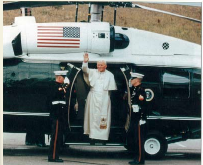
Pope John Paul II in the VH-60N

The VH-60N increases the long range distance capabilities of the presidential fleet, due to the folding capabilities for being transported into