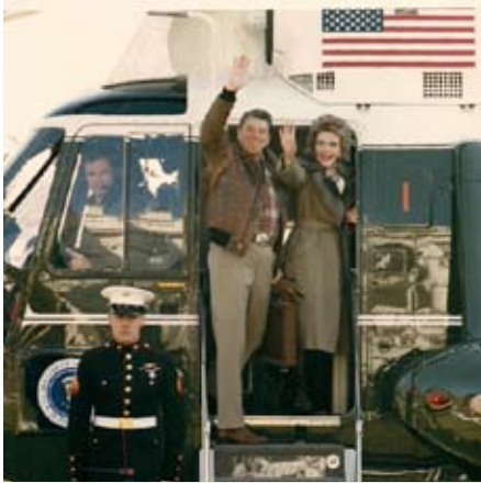
Ronald & Nancy Reagan