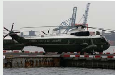
VH-3D on Wall Street Pier