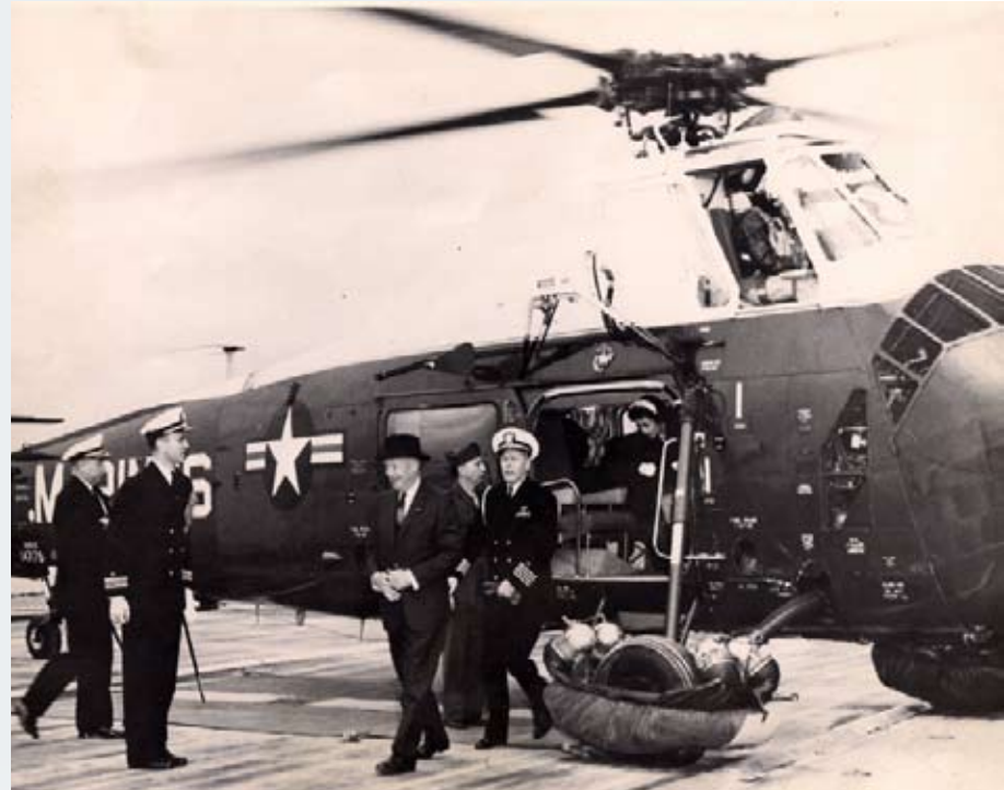
Army aircraft shown in the photo on the left and the Marine aircraft shown in the photo on the right.