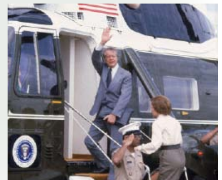
James & Rosalynn Carter