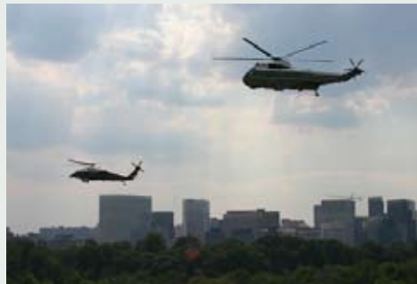
VH-60N & VH-3D Over N.Y.