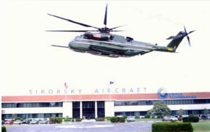
VH-53E Presidential Aircraft over the Sikorsky Helipad

President Reagan landing on the USS John F. Kennedy at the Statue of Liberty in the VH-53D to celebrate the 100th anniversary of the statue.