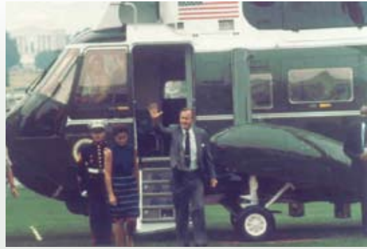
George H.W. Bush