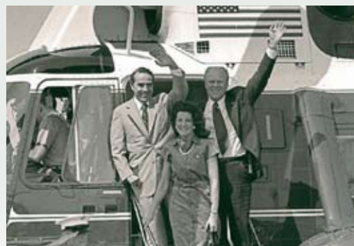
Gerald & Betty Ford and Robert Dole.