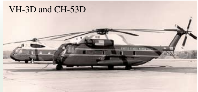
VH-3D and CH-53D

The Sikorsky heavy lift helicopters, CH-53D and CH-53E support the Marine One Presidential Executive fleet. The S-92 remains a viable aircraft for future presidential aircraft requirements.