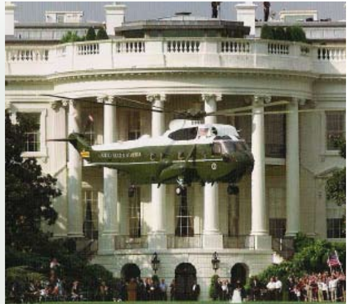
VH-3D hovering in front of White House

President John F. Kennedy was the first to fly in the VH-3A in May, 1962. The VH-3D is currently the primary presidential carrier. The aircraft has transported the president’s family and U.S. and foreign government officials.