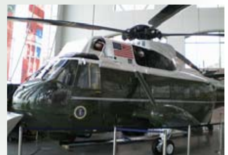
VH-3D in the Reagan Library