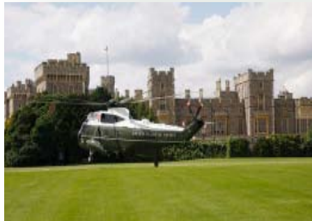
VH-3D at Windsor Castle