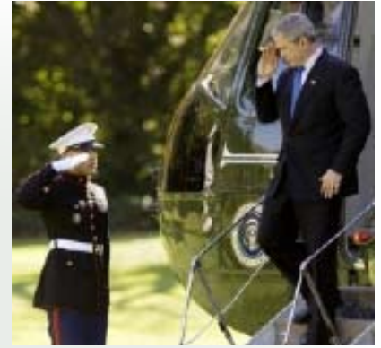
George W. Bush