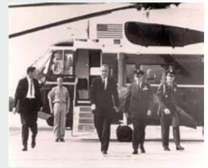
Lyndon B. Johnson