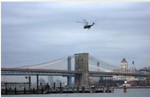
VH-3D over Brooklyn Bridge