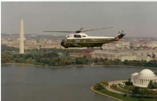
VH-3D flying over Washington, D.C.