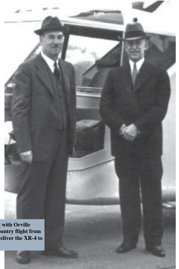
Igor Sikorsky at Wright Field with Orville Wright, following the cross country flight from Stratford to Wright Field to deliver the XR-4 to the Army.