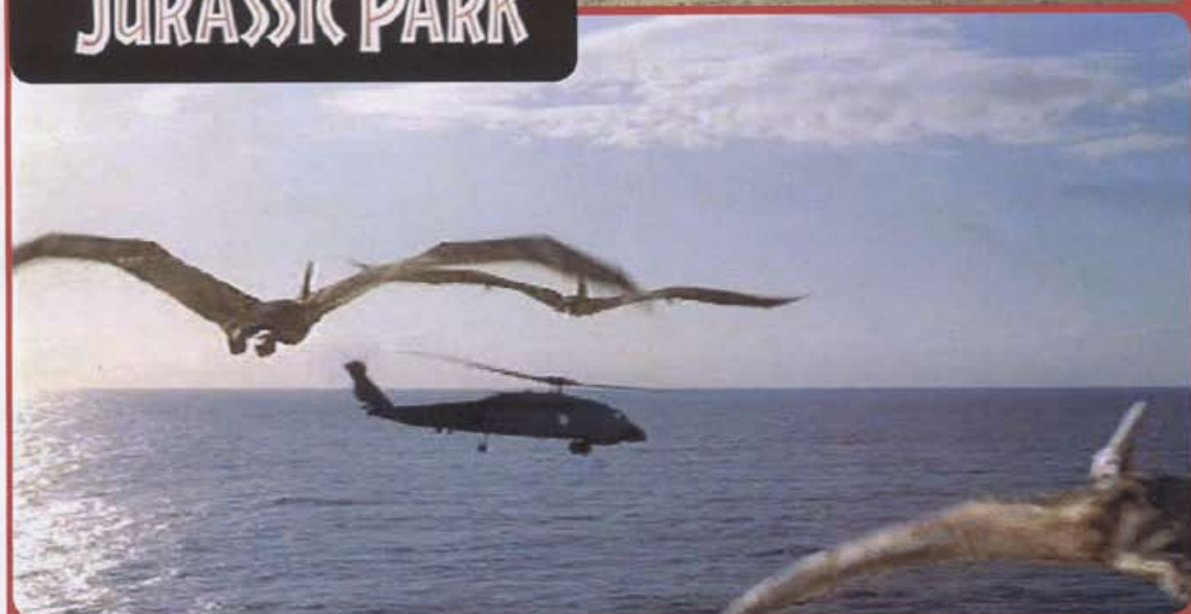
A Black Hawk flies with the pterodactyls in "Jurassic Park"

Space limitations only allowed us to show you Sikorsky involvement in a very few of the 50 or more pictures featuring our aircraft. Independence Day, War of the Worlds, Titanic, Perfect Storm, James Bond movies, all must wait until we can bring you another edition featuring these and some of the many others. Since all images were taken from DVDs of the movies, the picture quality is not quite as good as it would be using normal photographs.