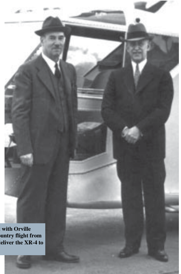
Igor Sikorsky at Wright Field with Orville Wright, following the cross country flight from Stratford to Wright Field to deliver the XR-4 to the Army.